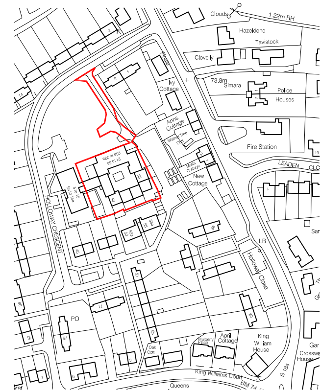
Location Plan scale 1:2500