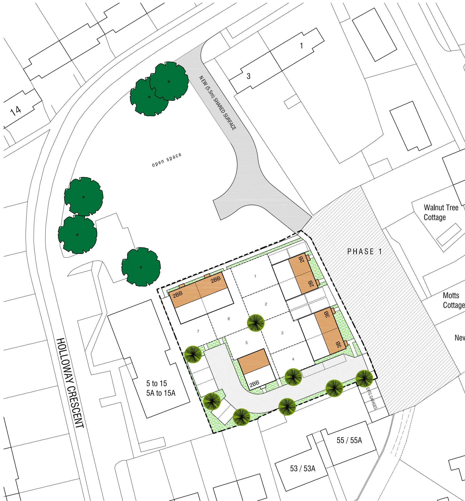
Site Plan scale 1:500